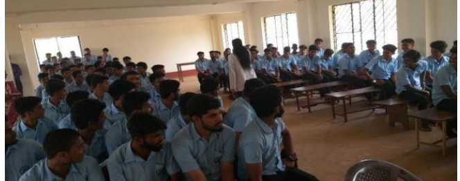
Students of Xavier's degree college Asaigoli

4. On the occasion of world Oral health day 2019, an awareness programme was held in Xavier's degree college Asaigoli on 02-05-2019. The programme commenced at 10.30 am and concluded at 11.30 am. Total students attended were 160.