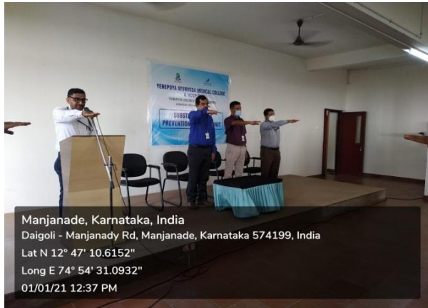
Oath taking programme

4. Substance free campus oath taking programme, Substance Abuse Prevention satellite Unite of Yenepoya Ayurveda Medical College Naringana, a unit of Yenepoya ( Deemed to be) University has organised Oath taking programme at YAMCH auditorium on account of Substance free campus on 1<sup>st</sup> January 2021 at 12.30 PM.