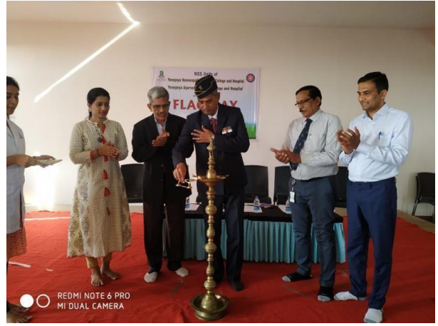
Armed Forces Flag Day inauguration

13. "Armed Forces Flag Day" was jointly organised by NSS Unit, Yenepoya Ayurveda Medical College and Hospital and NSS Unit, Yenepoya Homeopathic Medical College and Hospital on19<sup>th</sup> December 2019 at 03:00pm, Auditorium, YAMCH.