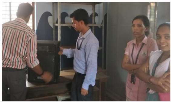
Anganvadi Kendra Asaigoli

7. International day of yoga, Department of swasthavrutta and yoga of Yenepoya Ayurveda Medical College and Hospital, Naringana, Mangalore. A Unit of Yenepoya (Deemed to be) University, has conducted basic yoga training programme from 10/06/2019 to 20/06/2019, For first year BAMS students and staff, to create awareness about Yoga. Total number of participants 125.